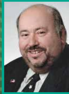
Joseph V. Doria, Jr. Mayor of The City of Bayonne